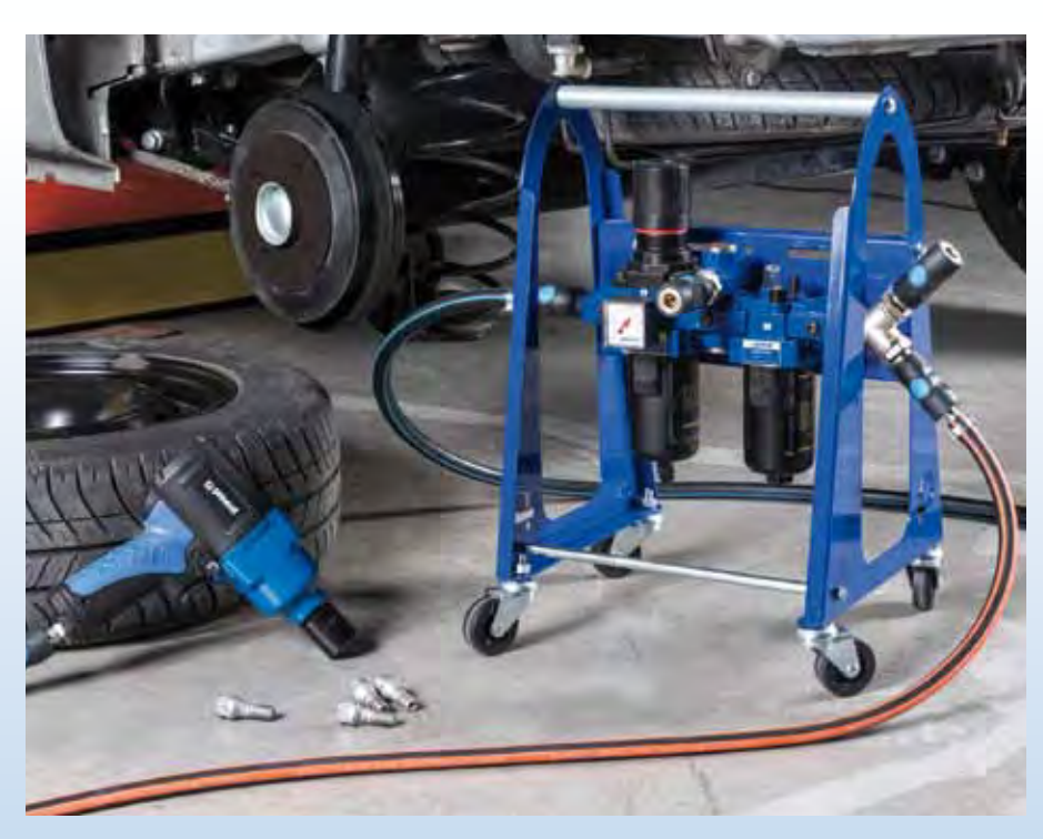
Air treatment and distribution assembly