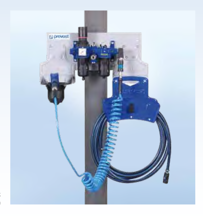
PLA plate for work station organisation