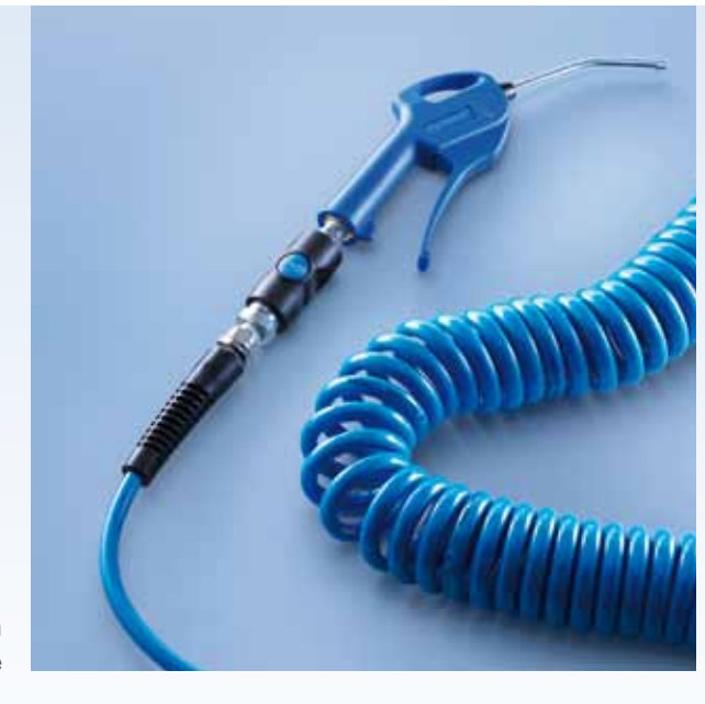
Blow guns 27102 with spiral extension hose