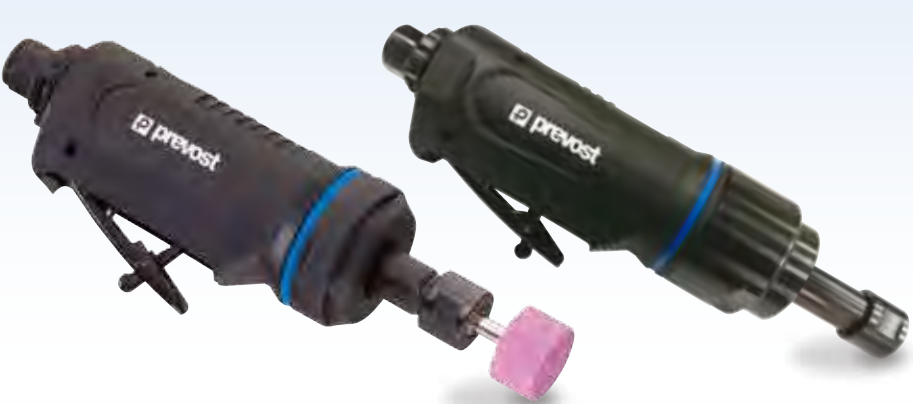
(optional grinding wheel)

TDG S22000: grinding, milling, stripping and deburring. TDG S04000: sawing, grinding, milling, stripping and deburring. Reduced speed to prevent overheating.